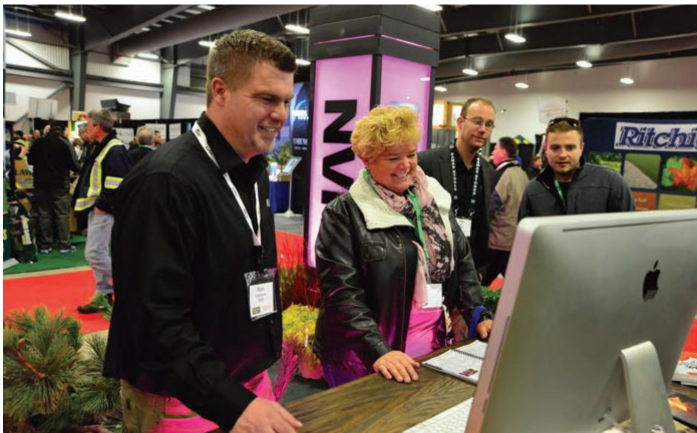
GreenTrade Expo in Ottawa is attracting more and more professionals each year.

tinues to be the highlight of the winter season for the Ottawa Chapter.