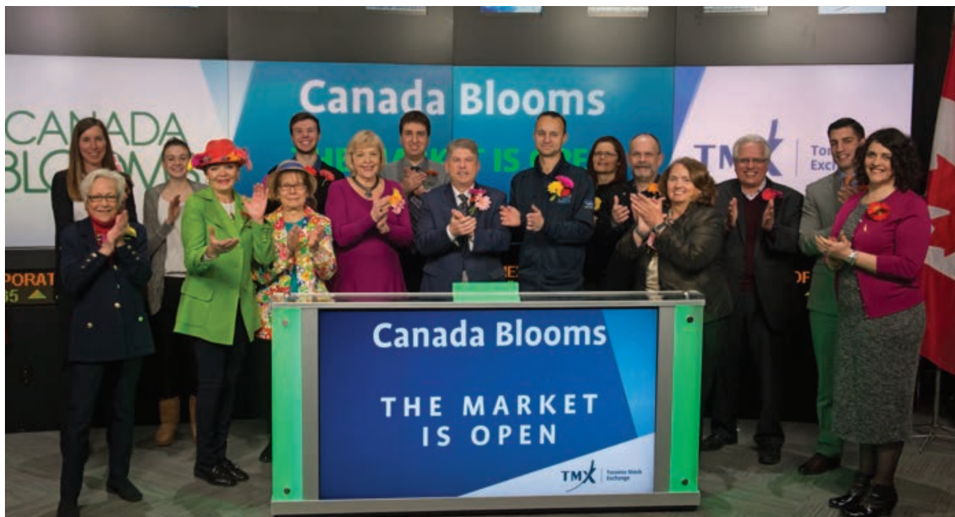
The Canada Blooms Board and LO executive opened the Toronto Stock Exchange on Mar. 16, 2016.

We have been working with the Ontario College of Trades to determine if we want to make horticulture a compulsory and licensed trade in Ontario. After an initial investigation we are at an impasse. The membership is split on whether it is a good idea to license the trade. Investigation will remain on the strategic plan for 2017.