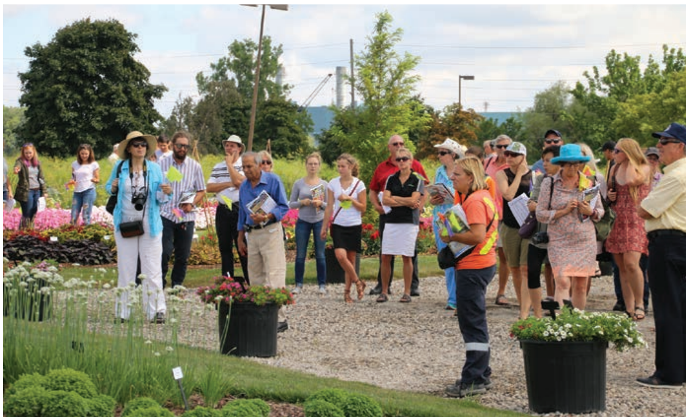
In partnership with the University of Guelph, the trial gardens at Landscape Ontario were expanded again this year and saw record attendance at the annual open house.

Horticultural Educators Association (HEA). We are involved with the Come Alive Outside Design Challenge, aimed at engaging young people in our profession. We provided guidance to universities which train tech teachers at the secondary level. The labour issue will continue to dominate 2017.