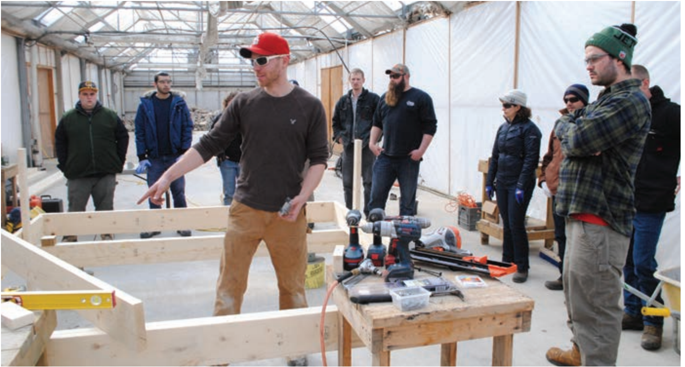
LO continues to offer top-notch education through its annual Professional Development series.