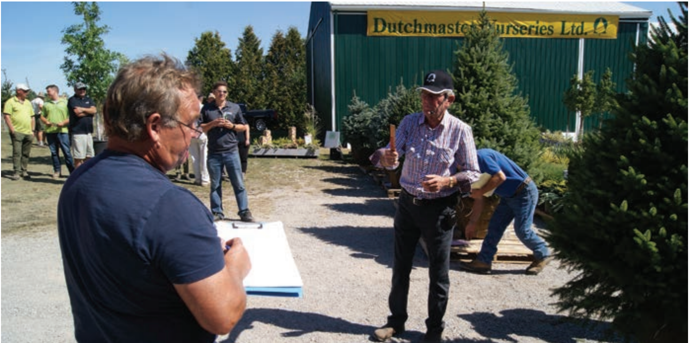
The annual growers auction continues to raise thousands of dollars each year for industry research and scholarships.