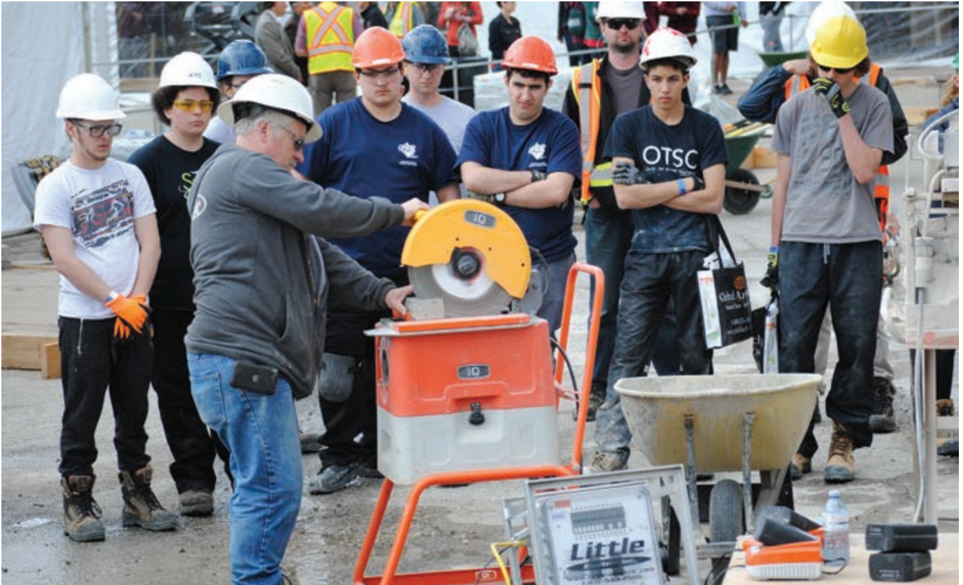
Landscape Ontario and its members continue to support students at all levels of education.