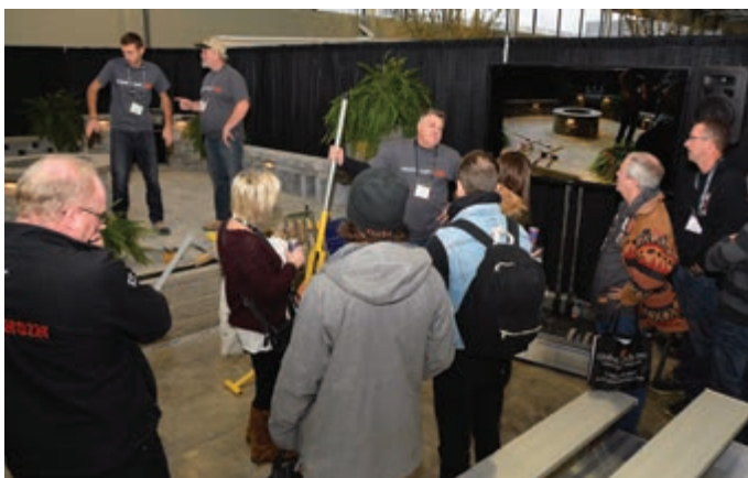
HardscapeLIVE!, presented by LO's Hardscape Committee was a very popular event each day at Congress '16.