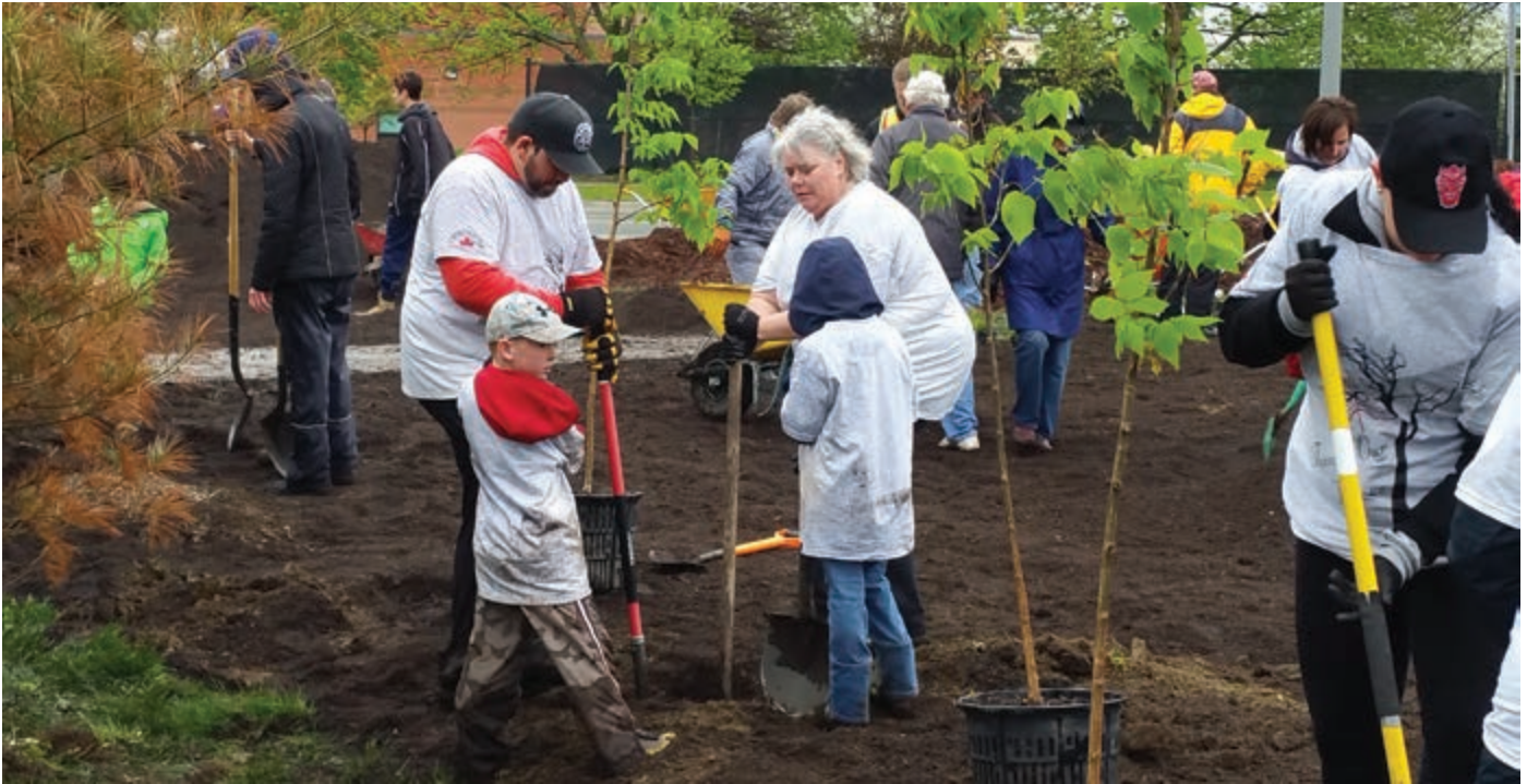
Both LO and local community members have helped to plant over 3,000 trees in the first year of the Highway of Heroes Living Tribute campaign.

piloted the idea of sector groups in each chapter. This will be considered in 2017.