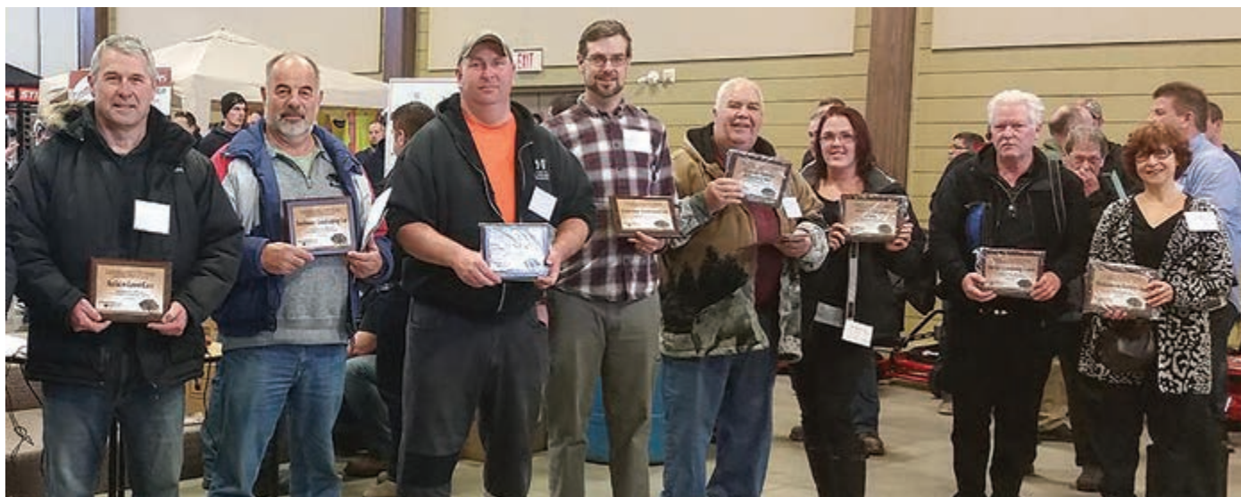
Long-time LO members were recognized this year with a special plaque.