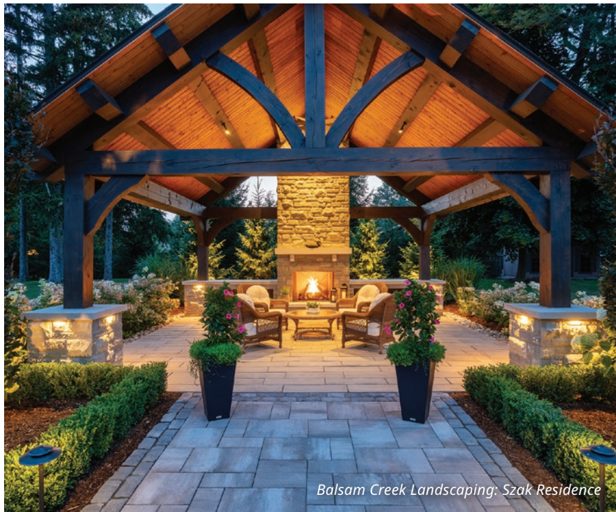
Balsam Creek Landscaping: Szak Residence

ACTION HOME SERVICES (X5) AVANTI LANDSCAPING BLUE DIAMOND POOLS AND LANDSCAPING (X2) BOULDER DESIGN INC GELDERMAN LANDSCAPE SERVICES GRANITE PARK INC GREEN ROOTS LANDSCAPING INC GRIFFITH PROPERTY SERVICES LTD HOGAN LANDSCAPING INC (X2) KENNETH MORGAN POOLS & LANDSCAPING LTD (X4) LANDSCAPE EFFECTS GROUP MATTHEW GOVE & CO MIKE'S LANDSCAPING NATURE'S CHOICE LANDSCAPE CONSTRUCTION LTD OUTDOOR REFLECTIONS (X2) PARKLANE LANDSCAPES PARKSCAPE LTD PLANTENANCE LANDSCAPE GROUP PRECISION LANDSCAPING (X2) PROSCAPE LAND DESIGN INC WILD RIDGE LANDSCAPES INC (X2) YARDS UNLIMITED LANDSCAPING INC (X4)