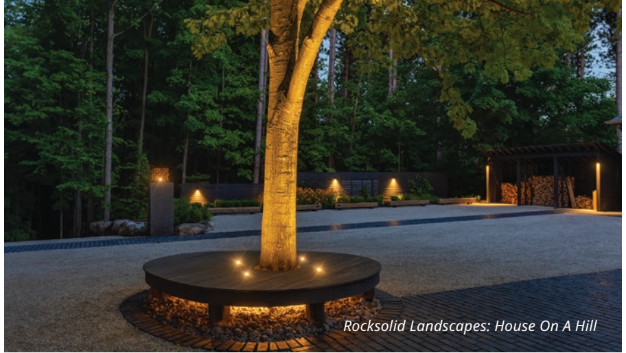
Rocksolid Landscapes: House On A Hill

BALSAM CREEK LANDSCAPING BAUN LANDSCAPES LTD FRONTIERS LANDSCAPE ARCHITECTURE (X2) GELDERMAN LANDSCAPE SERVICES HUTTEN & CO. LAND AND SHORE KENNETH MORGAN POOLS & LANDSCAPING LTD (X2) KENT FORD DESIGN GROUP INC LANDART LAND-CON LTD (X3) LANDSCAPE EFFECTS GROUP OAKRIDGE GROUP INC OGS LANDSCAPE SERVICES PARTRIDGE FINE LANDSCAPES LTD (X2) PRO-LAND LANDSCAPE CONSTRUCTION INC (X2) PROSCAPE LAND DESIGN INC ROCKSOLID LANDSCAPES INC TERRA OPUS GROUP THE LANDMARK GROUP WENTWORTH LANDSCAPES