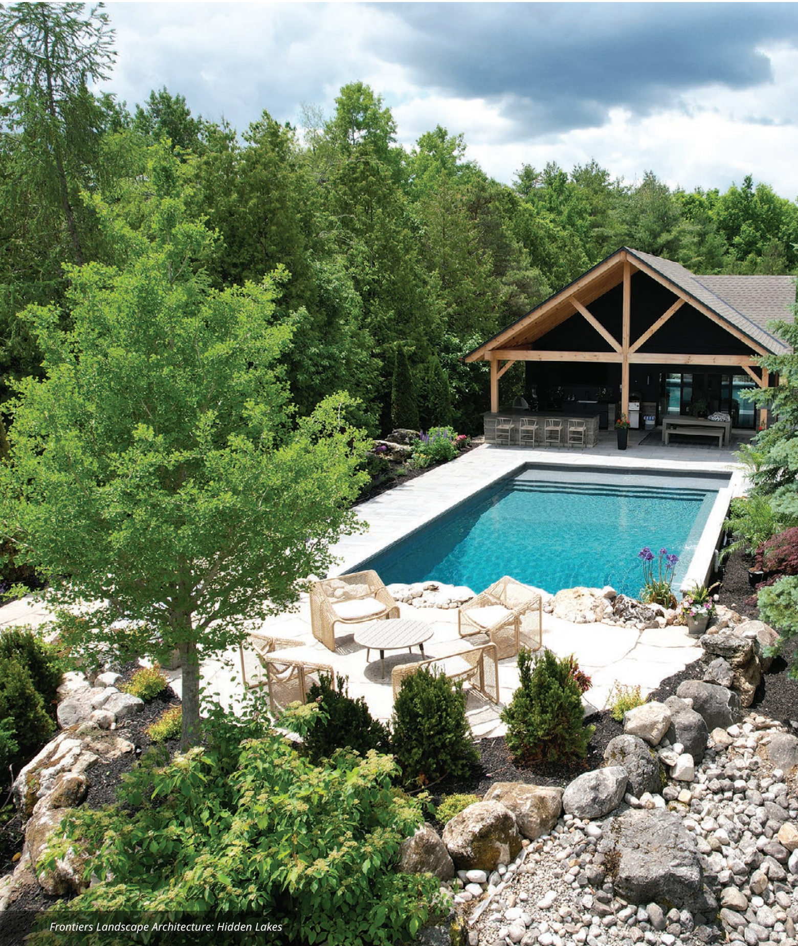
Frontiers Landscape Architecture: Hidden Lakes