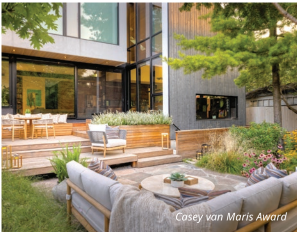
Casey van Maris Award