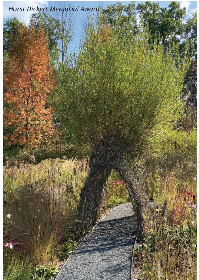
Horst Dickert Memorial Award