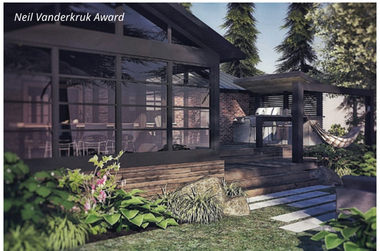
Neil Vanderkruk Award