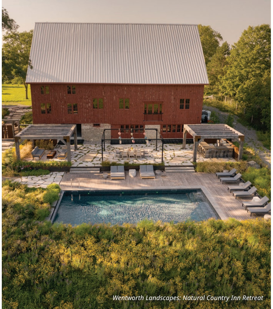
Wentworth Landscapes: Natural Country Inn Retreat

ROCKSCAPE For: Leonard Lake Property Residential Construction | $250,000-$500,000