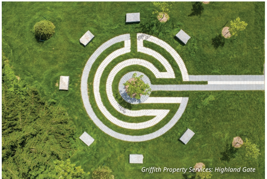
Griffith Property Services: Highland Gate

WOOD BULLY LTD For: Secret Garden Residential Construction | $100,000-$250,000