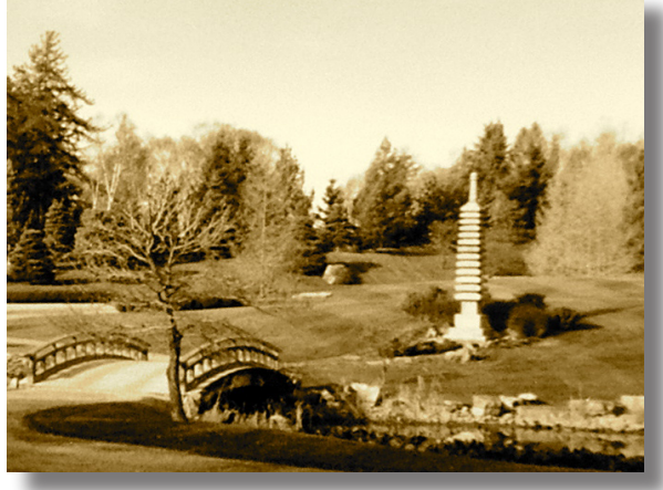
Autumn - the thirteen level granite pagoda represents the thirteen levels to enlightenment in the Buddhist faith.